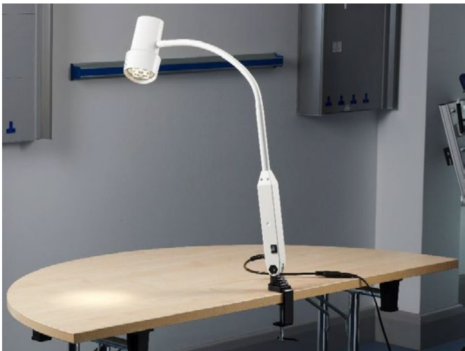
Desk mounted CLED50SXDP